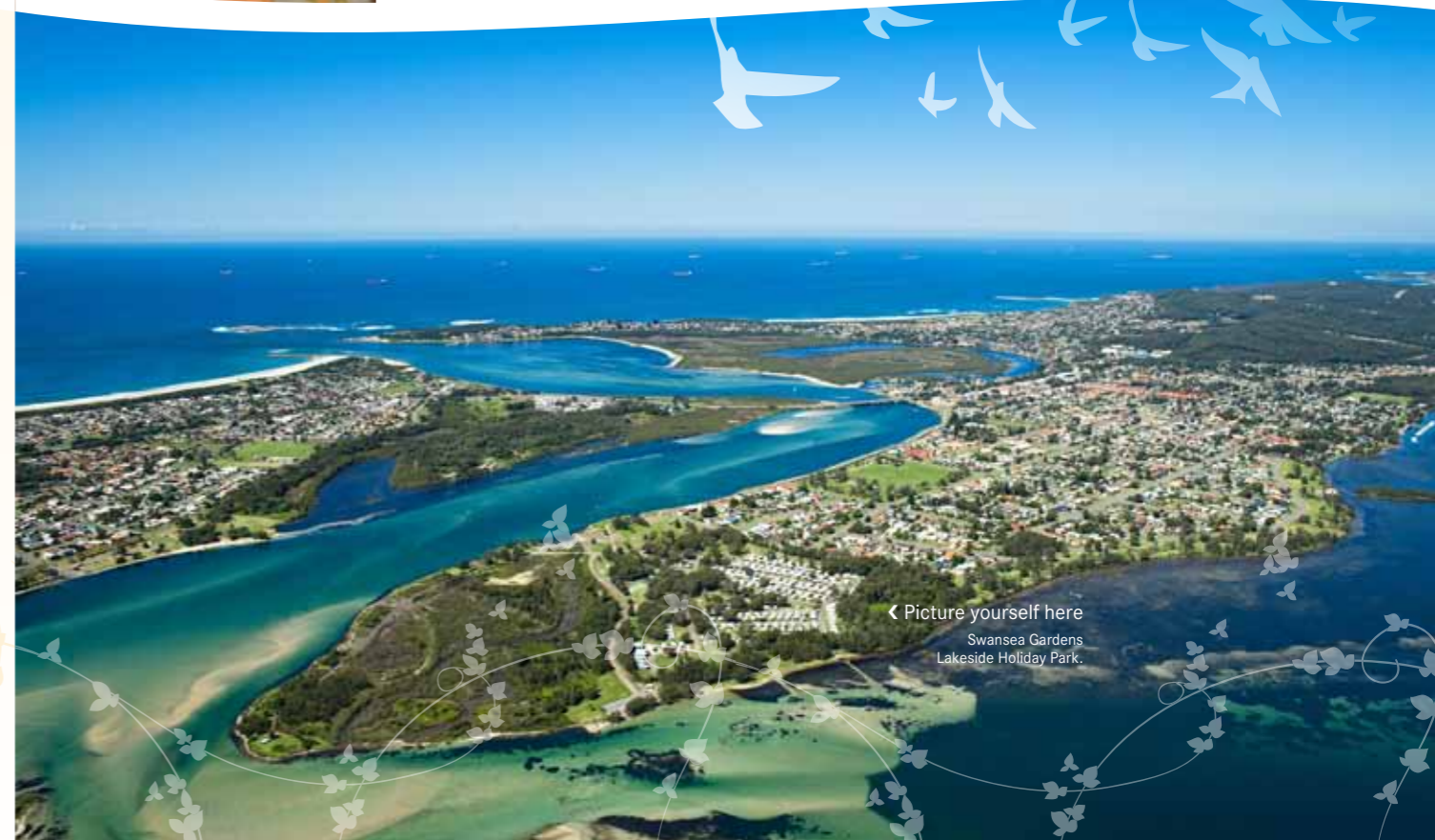
◀ Picture yourself here Swansea Gardens Lakeside Holiday Park.

Thank you for staying with us at Lake Macquarie Holiday Parks , give the friendly and helpful Park Managers a call to make your next holiday even more memorable and relaxing or simply visit www.lakemacholidayparks.com.au and book online.